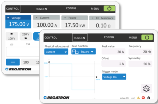
Figure 3: Intuitive control by HMI touch display. Everything you need at a glance.

The HMI built into the front panel allows comprehensive and convenient operation of the power supply via touch display.