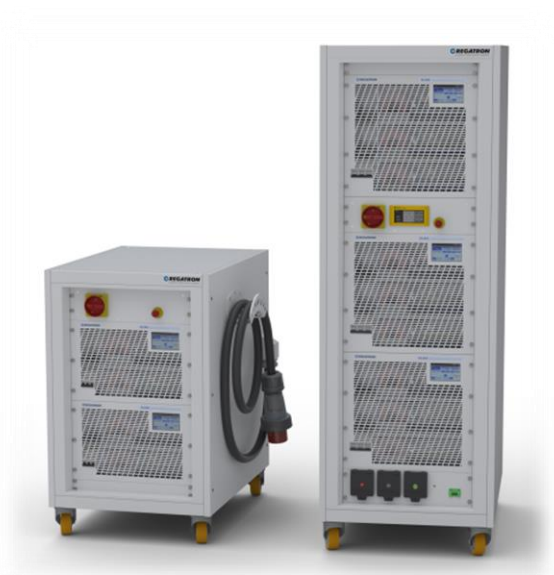
Figure 3: REGATRON's rack-integrated turn-key system solutions, e.g., 72 kW (left) and 162 kW (right) power levels. Various types of AC/DC connectors and cables allow for comfortable handling. Third-party product integration and numerous safety options are additional features.