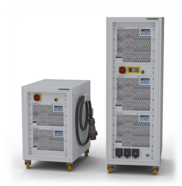
Figure 4: REGATRON's rack-integrated turn-key system solutions, e.g., 72 kW (left) and 162 kW (right) power levels. Various types of AC/DC connectors and cables allow for comfortable handling. Third-party product integration and numerous safety options are additional features.