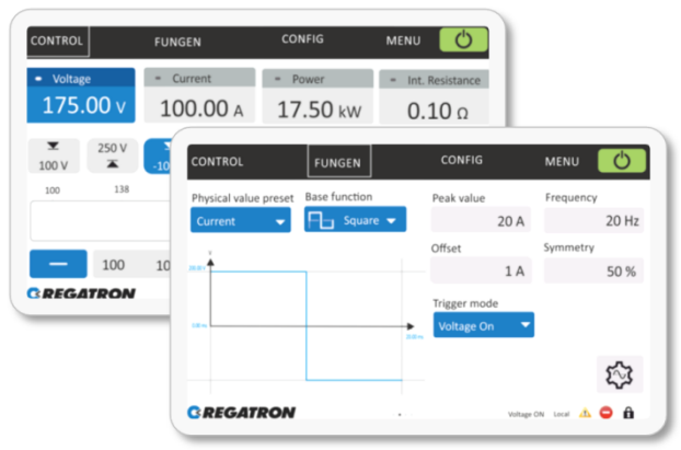
Figure 3: Intuitive control by HMI touch display. Everything you need at a glance.

The HMI built into the front panel allows comprehensive and convenient operation of the power supply via touch display.