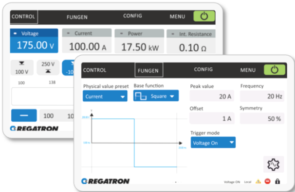
Figure 3: Intuitive control by HMI touch display. Everything you need at a glance.

The HMI built into the front panel allows comprehensive and convenient operation of the power supply via touch display.